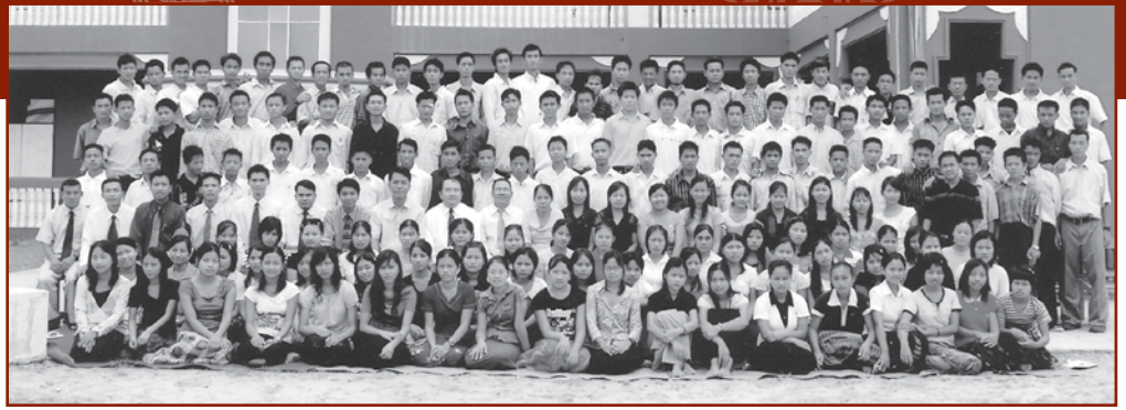
Faculty and students of Biblical School of Theology