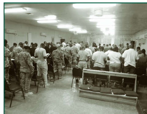
Chaplain leading Bible study in Afghanistan

Thank you very much for your excellent site. Your love for the Lord